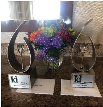
Top ID Awards