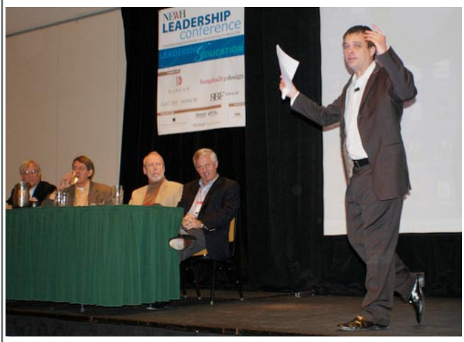
Informative, Industry-focused Panel Sessions