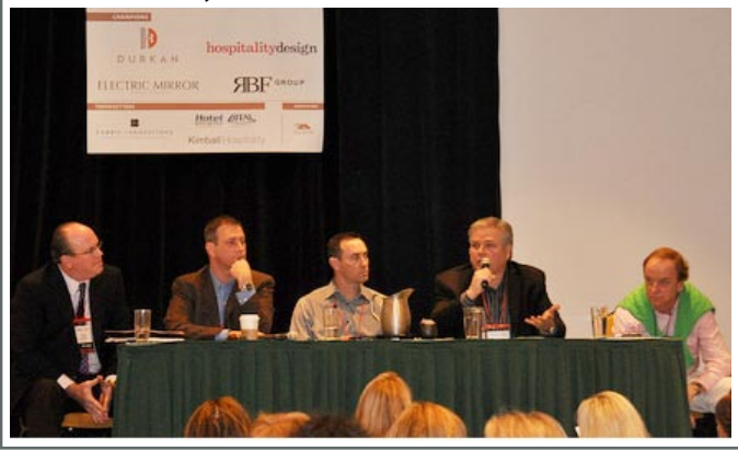
* Programs, speakers and topics are subject to change.