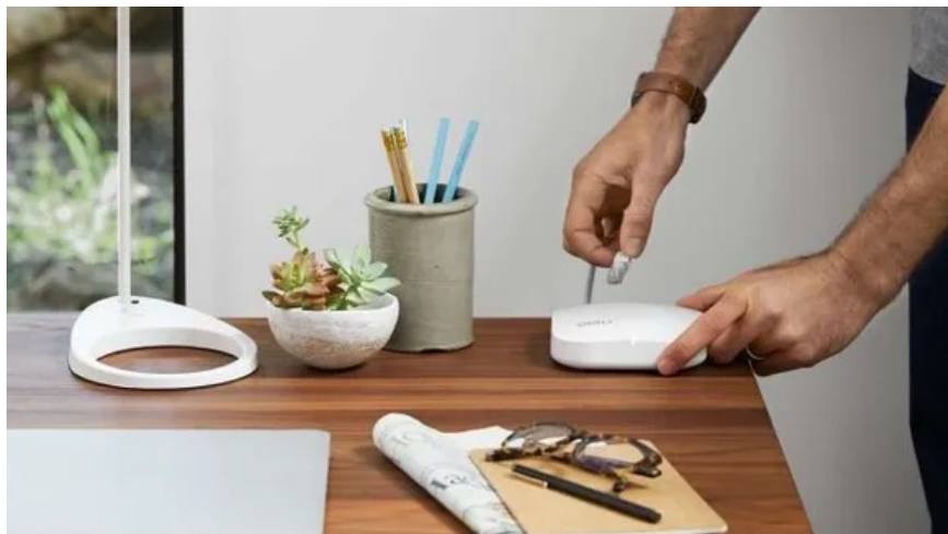
Get rid of your ugly old router for good.

Published 5:14 p.m. ET March 19, 2020 | Updated 5:16 p.m. ET March 19, 2020