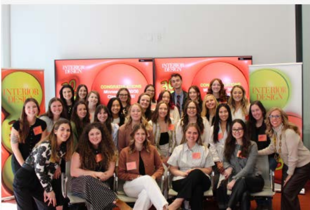
INTERIOR DESIGN MAGAZINE 30|30 DESIGN AWARDS