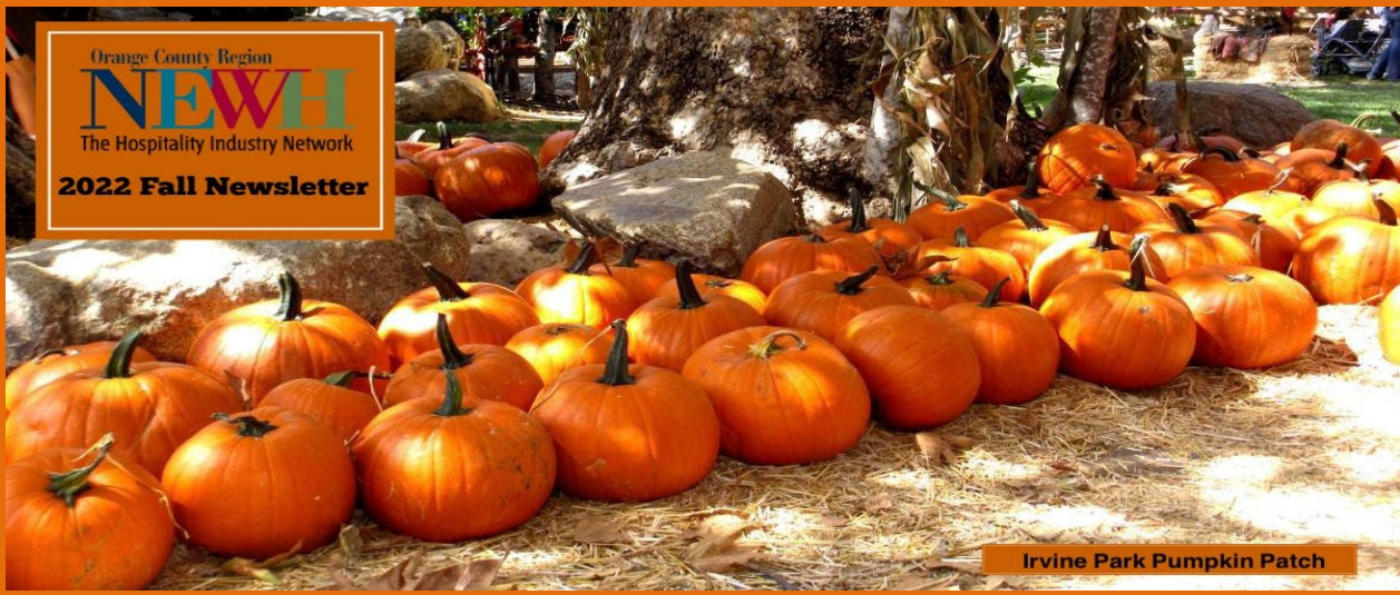
Irvine Park Pumpkin Patch