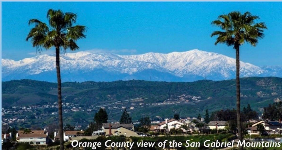
Orange County view of the San Gabriel Mountains