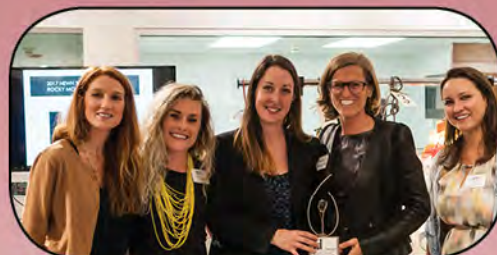
ROWLAND + BROUGHTON ARCHITECTURE URBAN DESIGN INTERIOR DESIGN

From the entire Chapter, congratulations again to these exceptional and distinguished design firms! We thank you for the beautiful work, your continued support, and your fearless leadership within the hospitality industry.